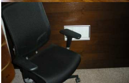
Our Floors & Walls Stripped bare. Conference Room Table & Office Chair donated by APG Furnishings.